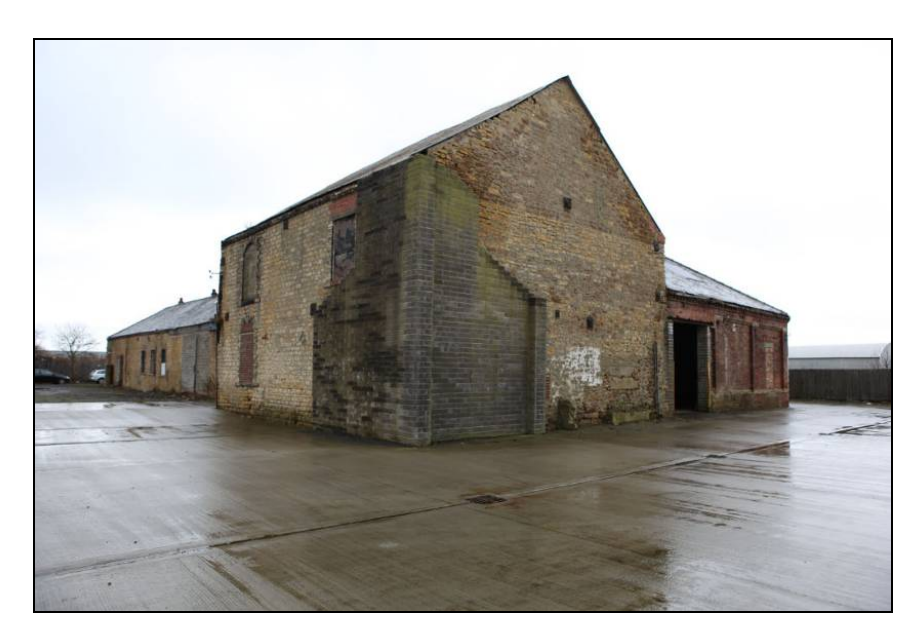
Fig. 11 Former NCB Workshops