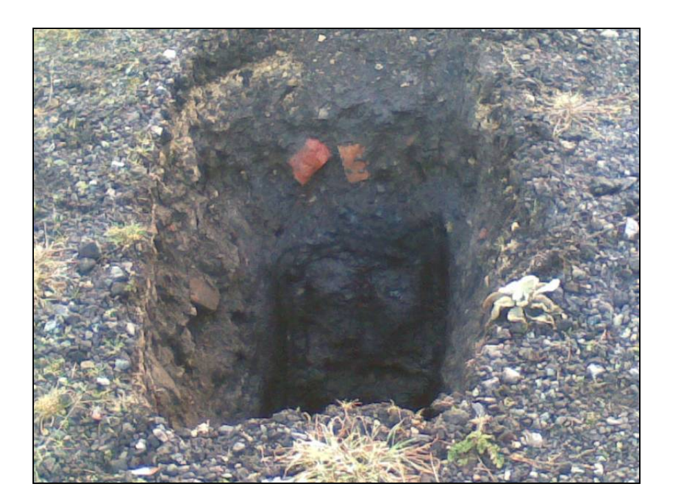
Fig. 12 Test Pit