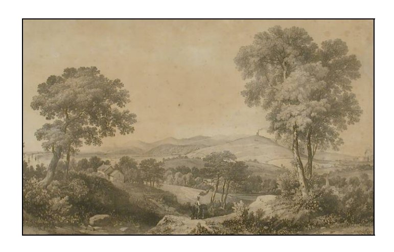
Painting of Hetton Colliery 1820

Archaeological Research Services Ltd Report No. 2010/33 May 2010