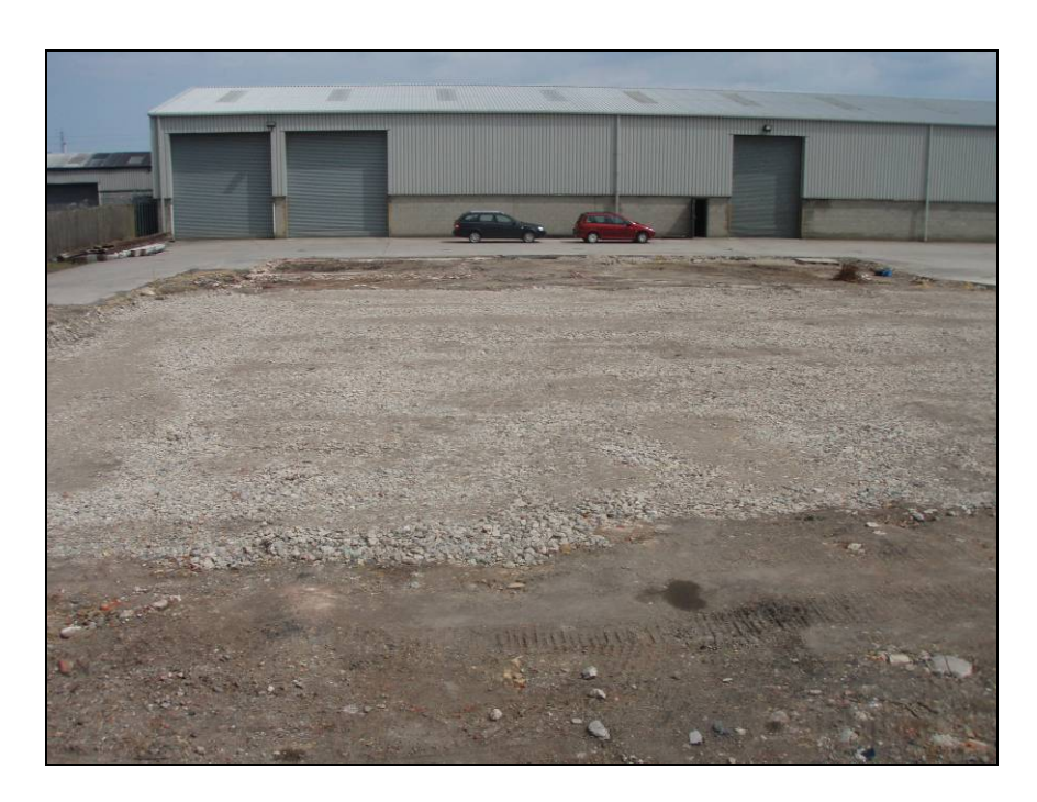
Fig. 14 Post demolition