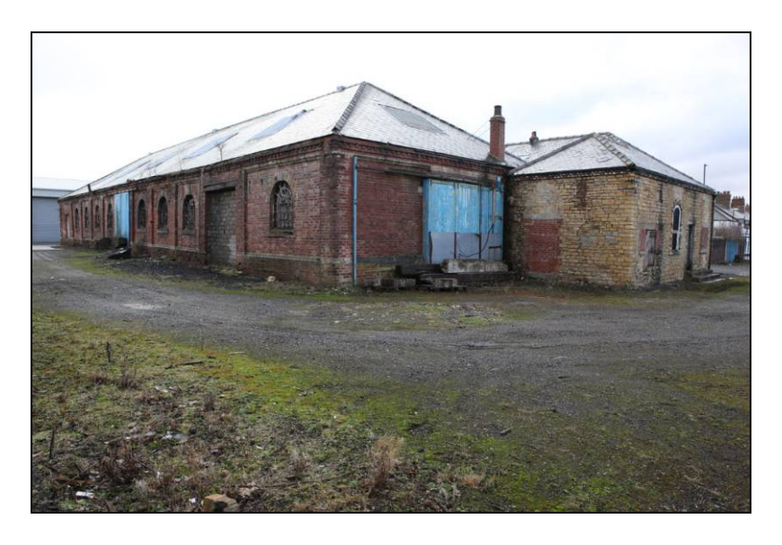
Fig. 10 Former NCB Workshops