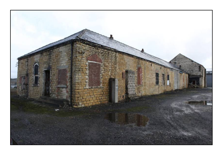
Fig. 9 Former NCB Workshops