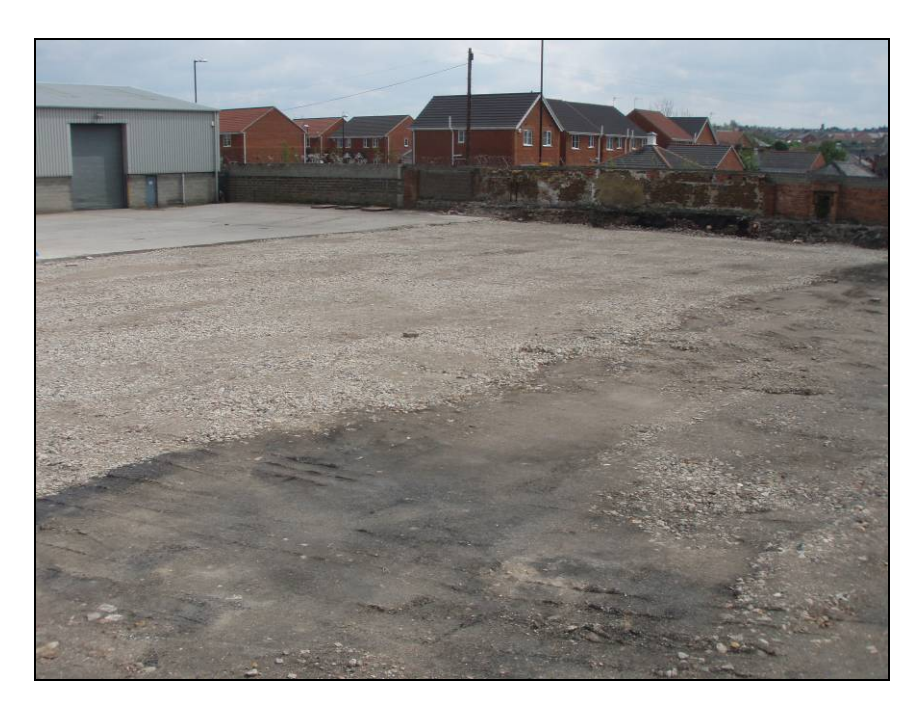
Fig. 13 Post demolition