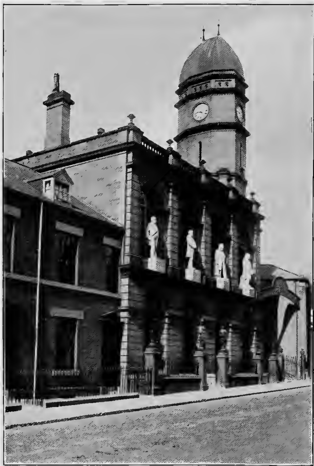
THE MINERS' HALL, DURHAM