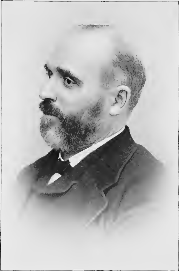
WILLIAM CRAWFORD, M.P.